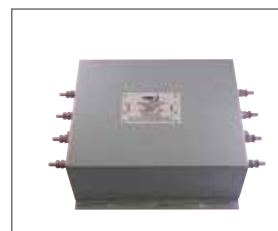
High Current 3 Phase Filter

High Performance Equipment Filters 10/12